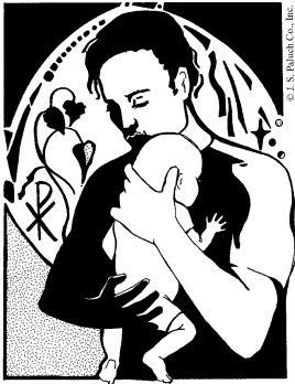
Happy Father's Day